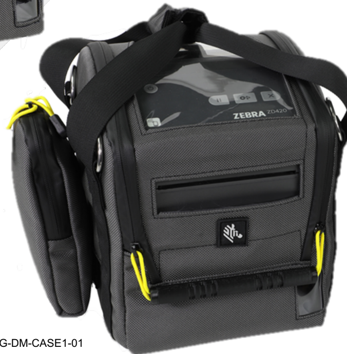
Direct Thermal p/n: SG-DM-CASE1-01

Easily bring your desktop printer to the point of application