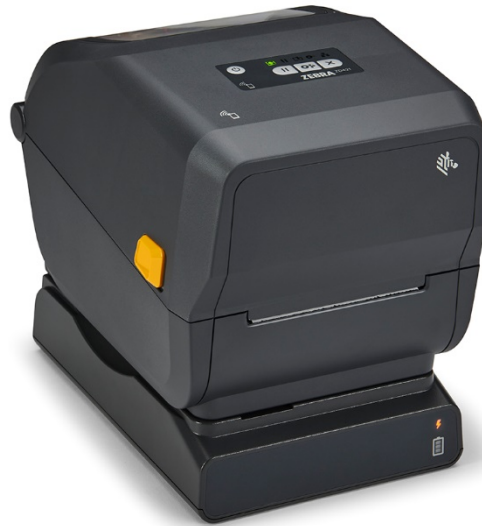
4-inch direct thermal ZD42Xd ZD62Xd