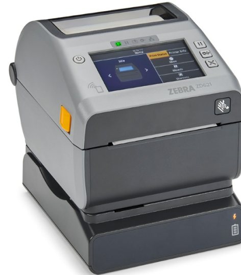
4-inch thermal transfer ZD42Xc (cartridge) ZD42Xt ZD62Xt