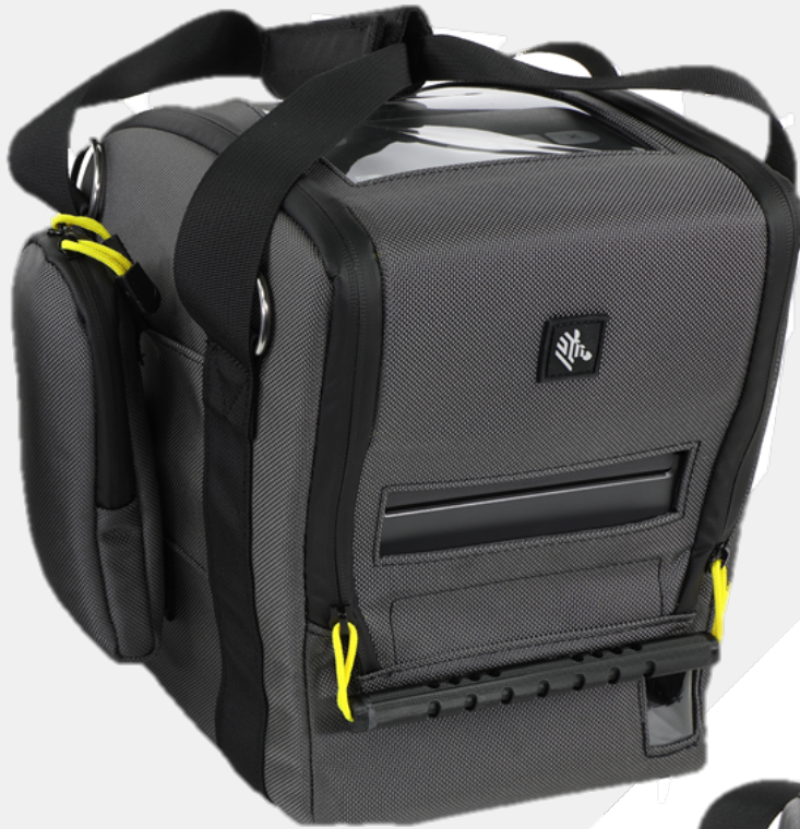
Thermal Transfer p/n: SG-DM-CASE2-01

YOUR DESKTOP PRINTER JUST GOT MORE CONVENIENT