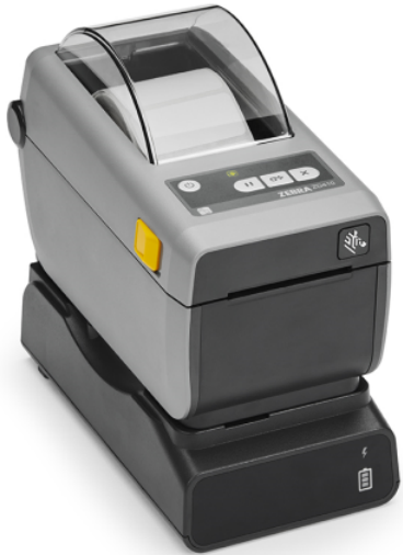
2-inch direct thermal ZD410d