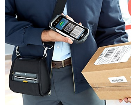
Carried by worker