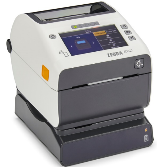
Healthcare Models ZD410, 42X, 62X